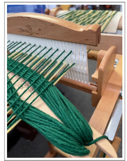
Shuttle going under the last warp thread.