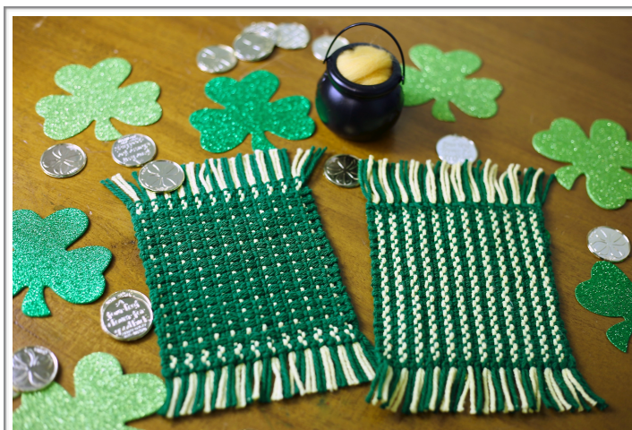
Bonus Fact - It's Reversible!

Repeat steps 1 through 4 a total of 15 times. Finish with steps 3 and 4 once again.