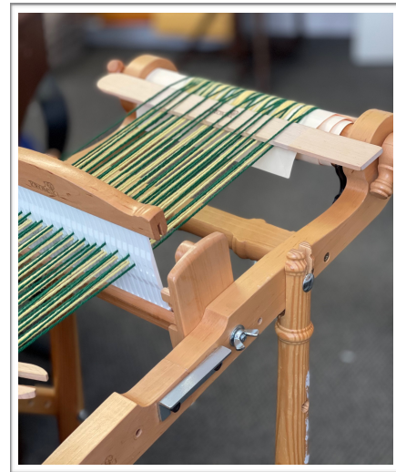
Pick Up Stick pushed back to the rear