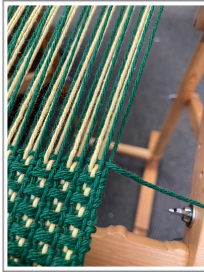
The end warp thread must be caught.