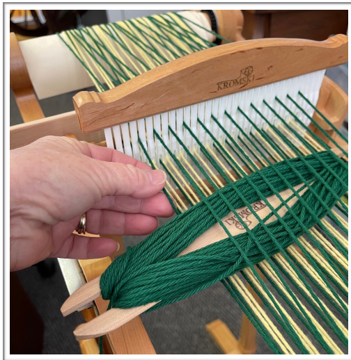
Shuttle going over the first warp thread.